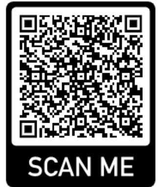
3. NCMP in Schools