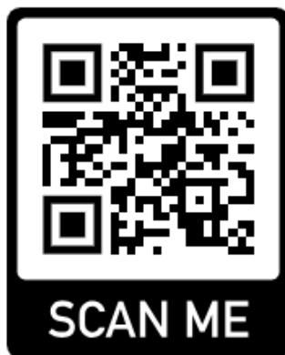
5. Recipes, articles and top tips to help you live healthy and happy