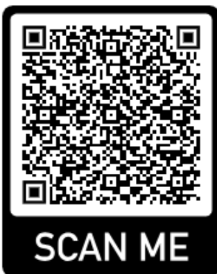
4. Guidance: how to talk to your child about weight